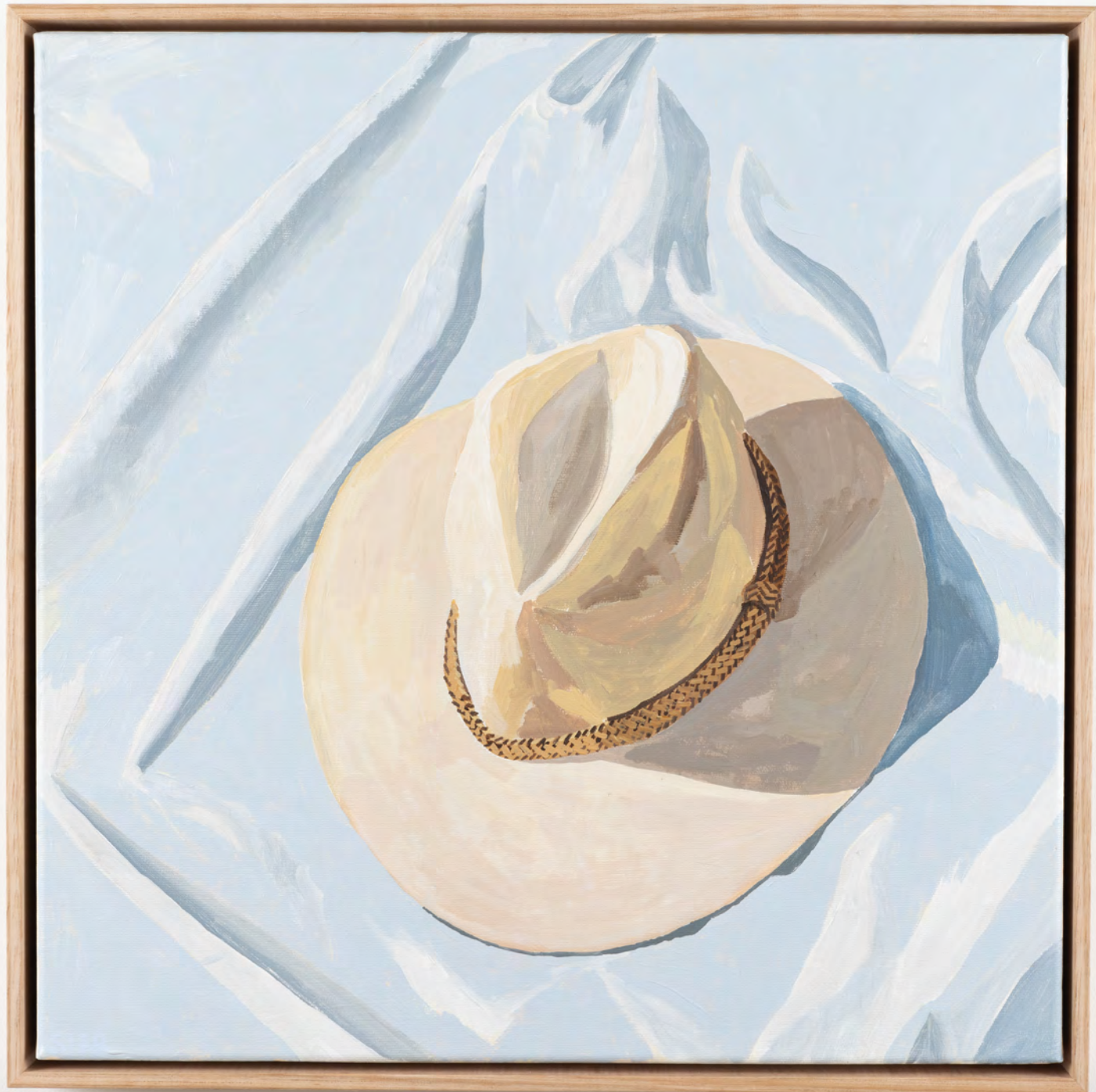
Bethany Saab Hat II 2022 acrylic on canvas 50 x 50 cm $1,450