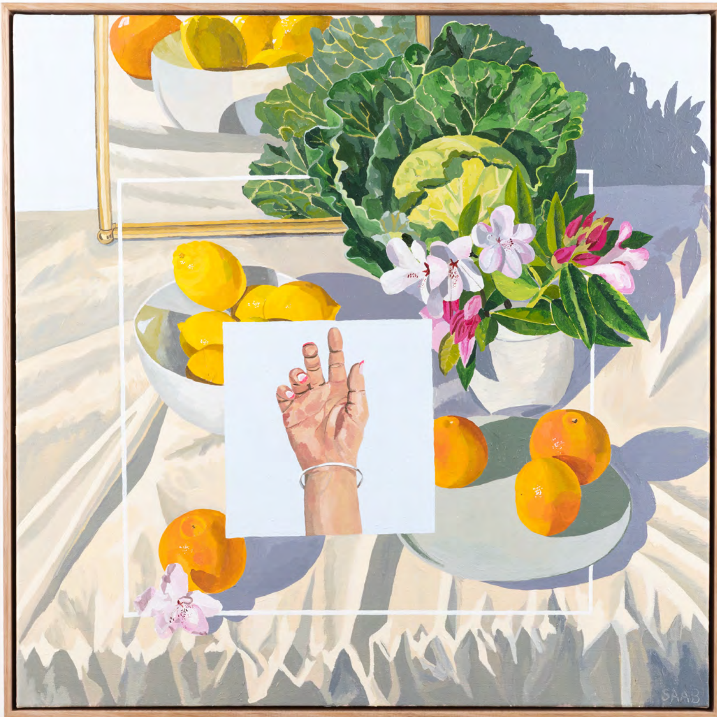
Bethany Saab Gesture II (with cabbage) 2022 acrylic on canvas 76 x76 cm $2,200