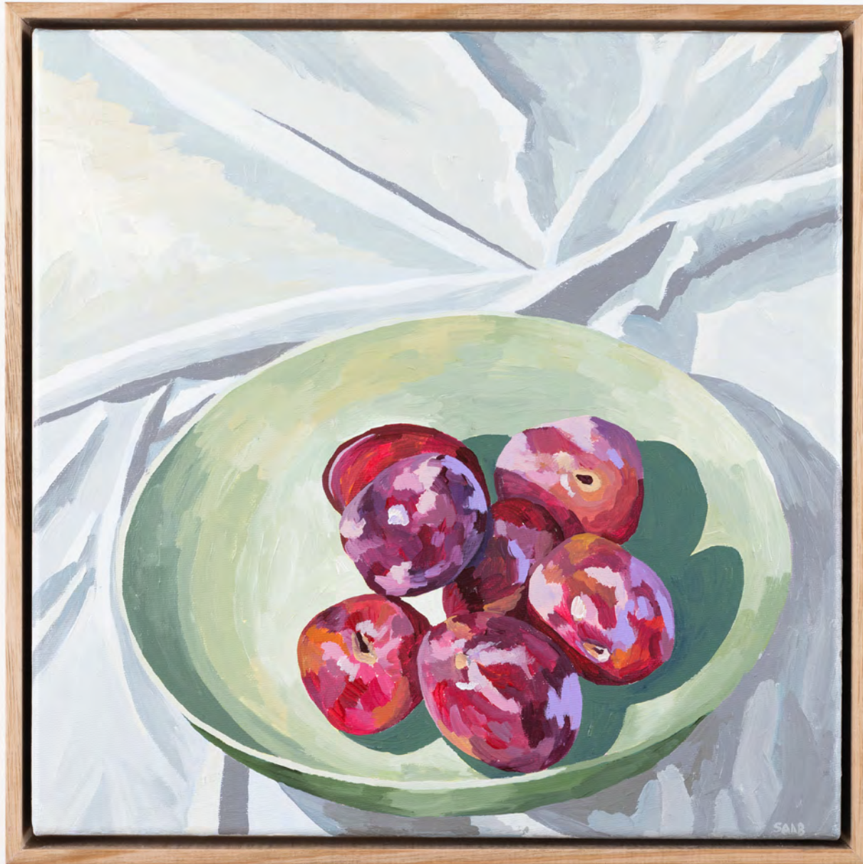
Bethany Saab Plums II 2022 acrylic on canvas 40 x 40 cm $1,200