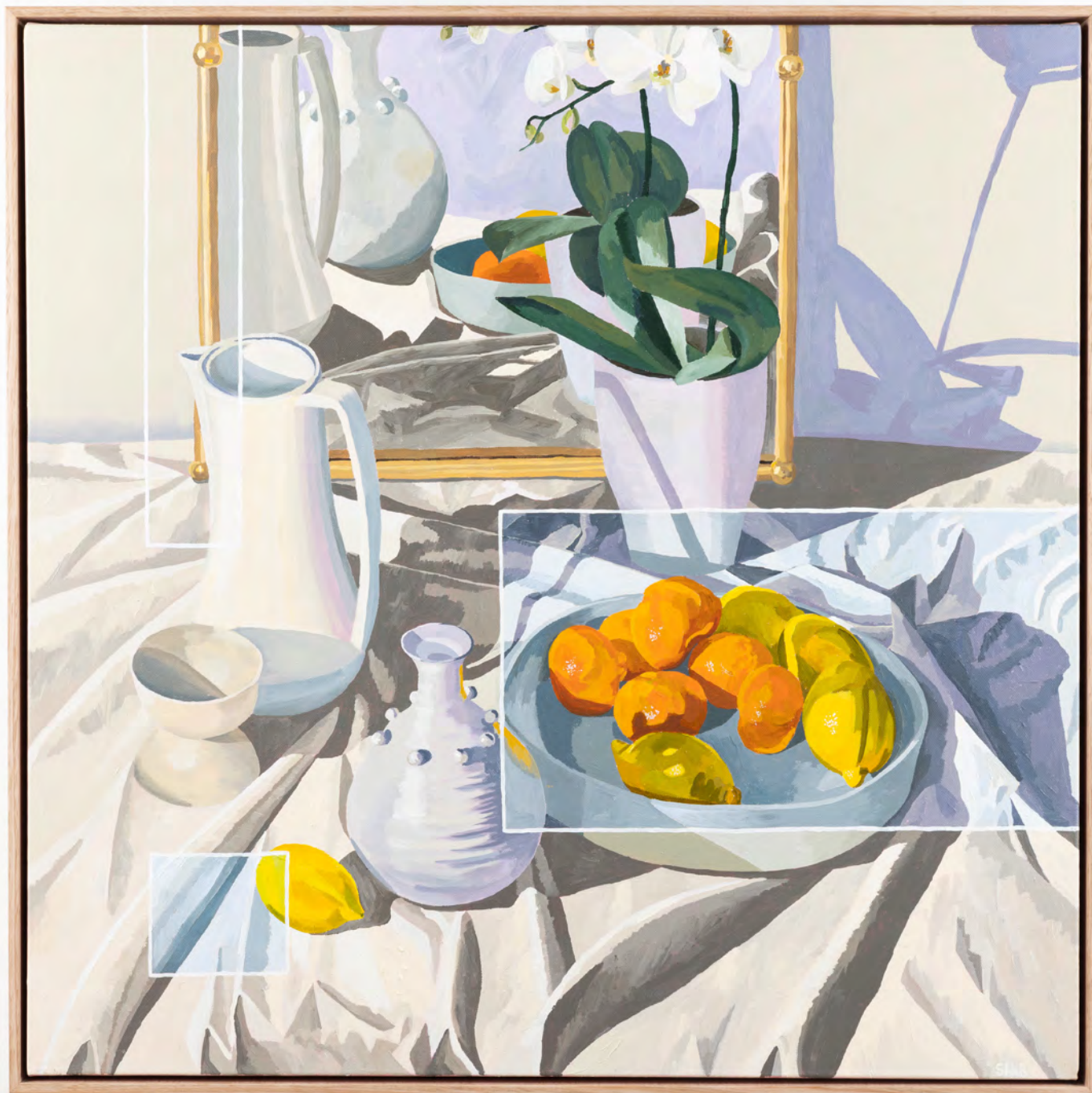
Bethany Saab Still life with panes (citrus segments) 2022 acrylic on canvas 76 x76 cm $2,200