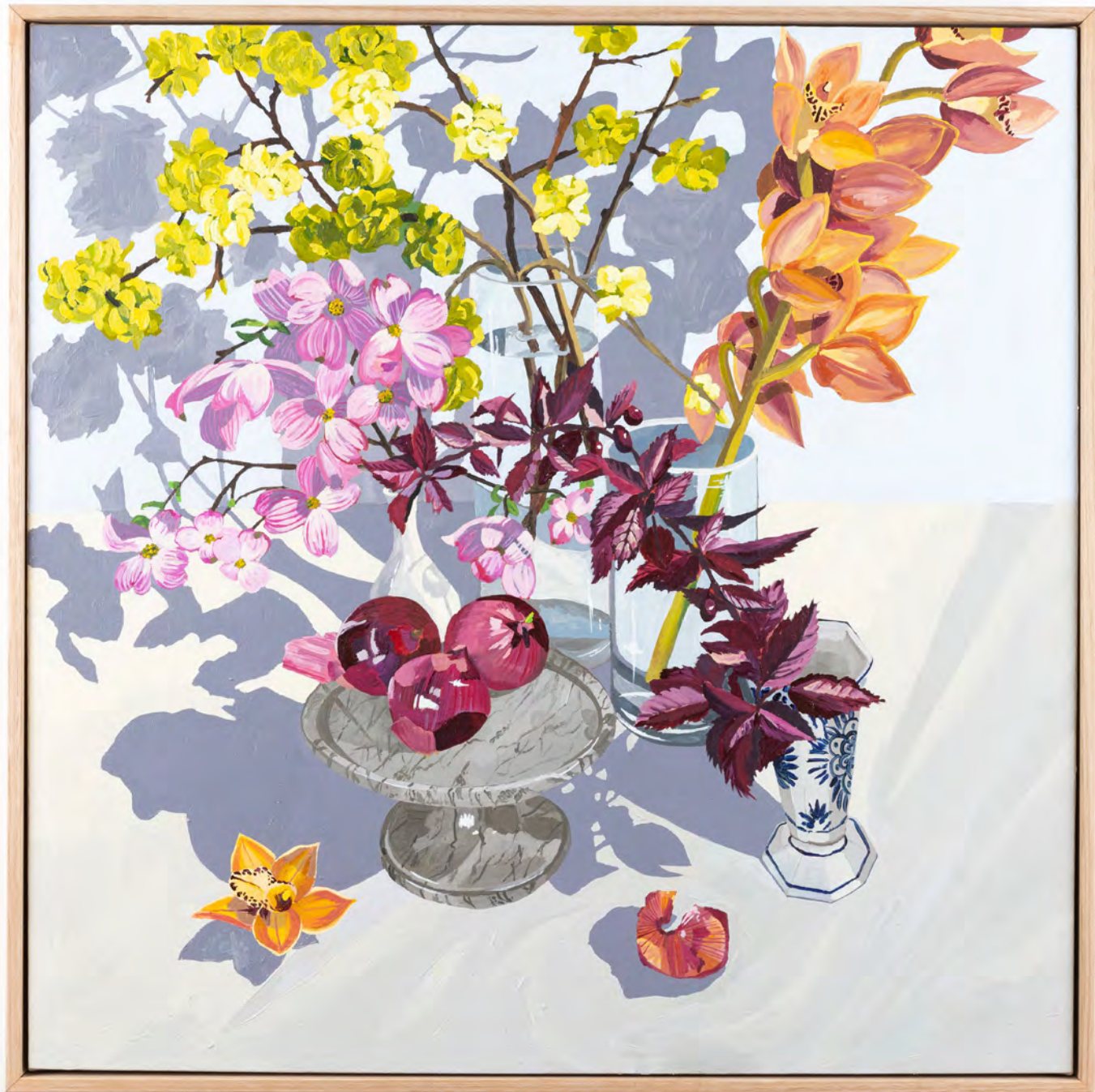
Bethany Saab Onions and orchids 2022 acrylic on canvas 70 x 70 cm $2,100