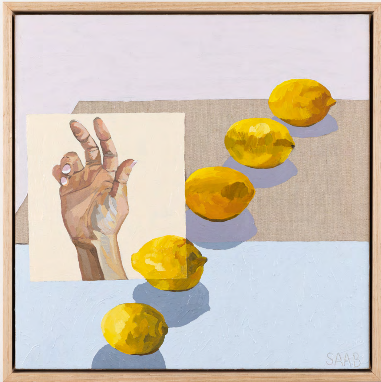
Bethany Saab Gesture III with lemons 2022 acrylic on canvas 40 x 40 cm $1,200