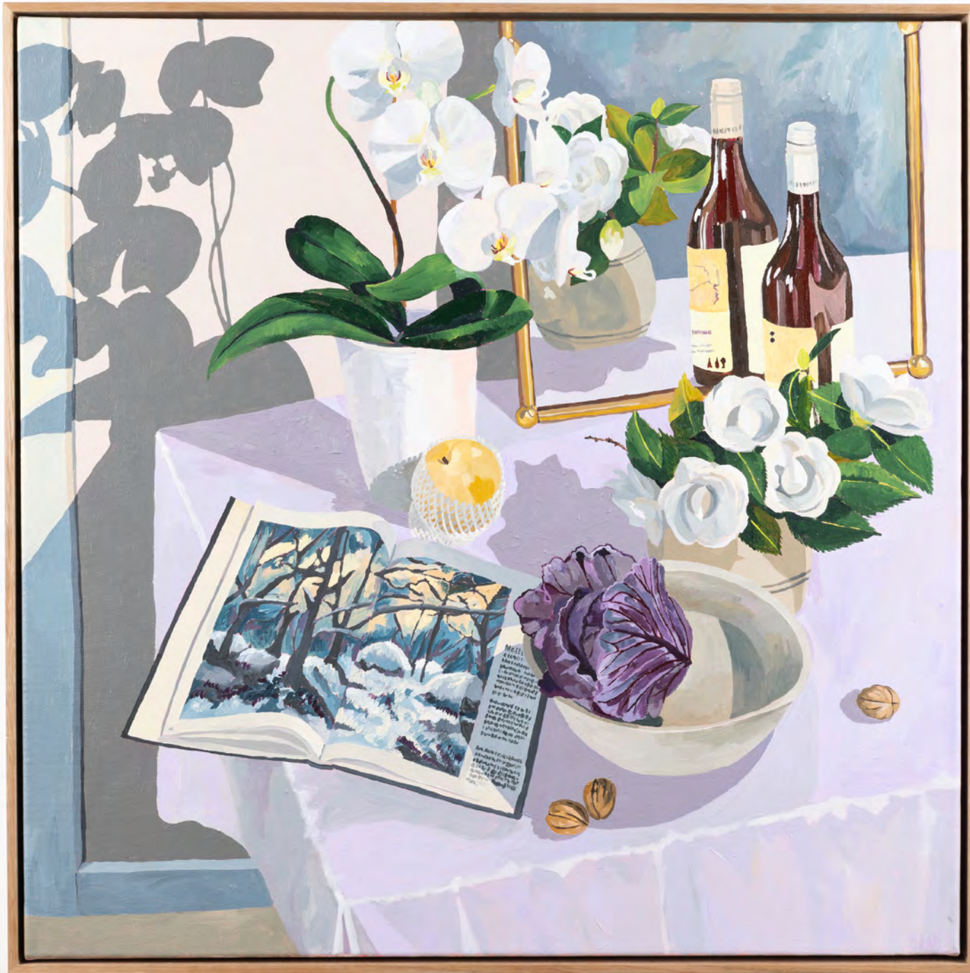
Bethany Saab White flowers with melting snow 2022 acrylic on canvas 76 x76 cm $2,200