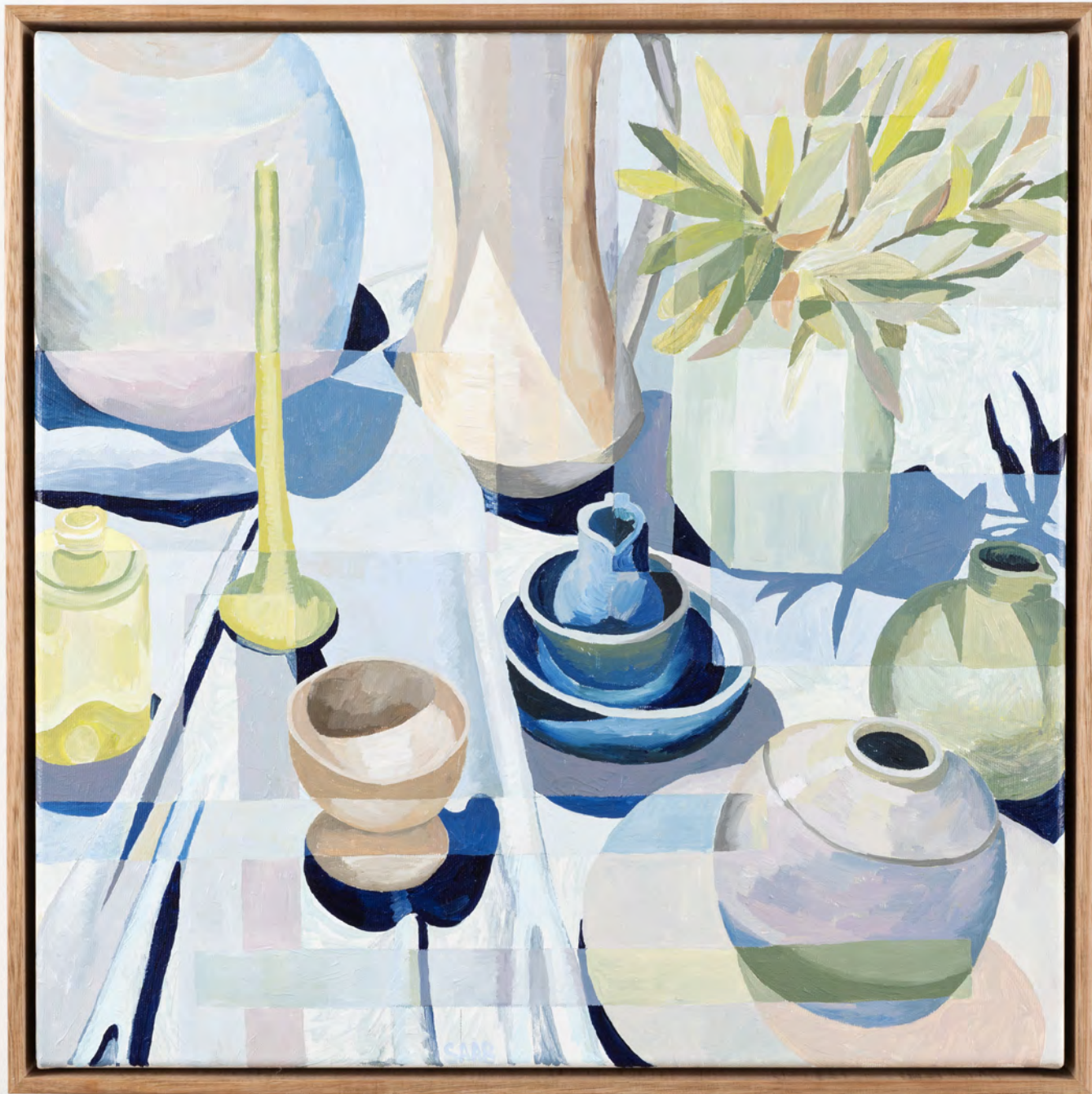
Bethany Saab Fragments 2022 acrylic on canvas 50 x 50 cm $1,450