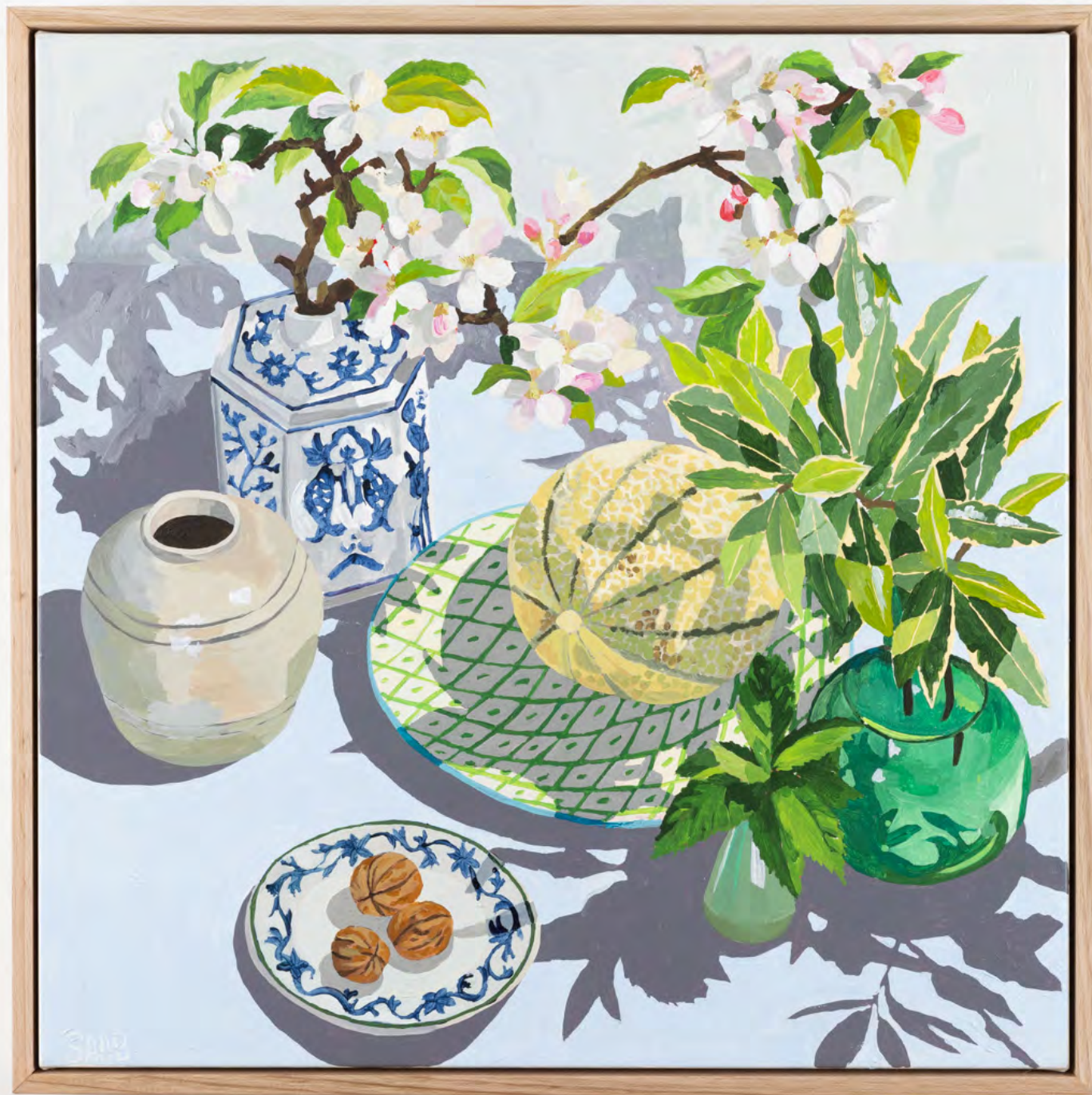
Bethany Saab Blossoms and walnuts 2022 acrylic on canvas 50 x 50 cm $1,450