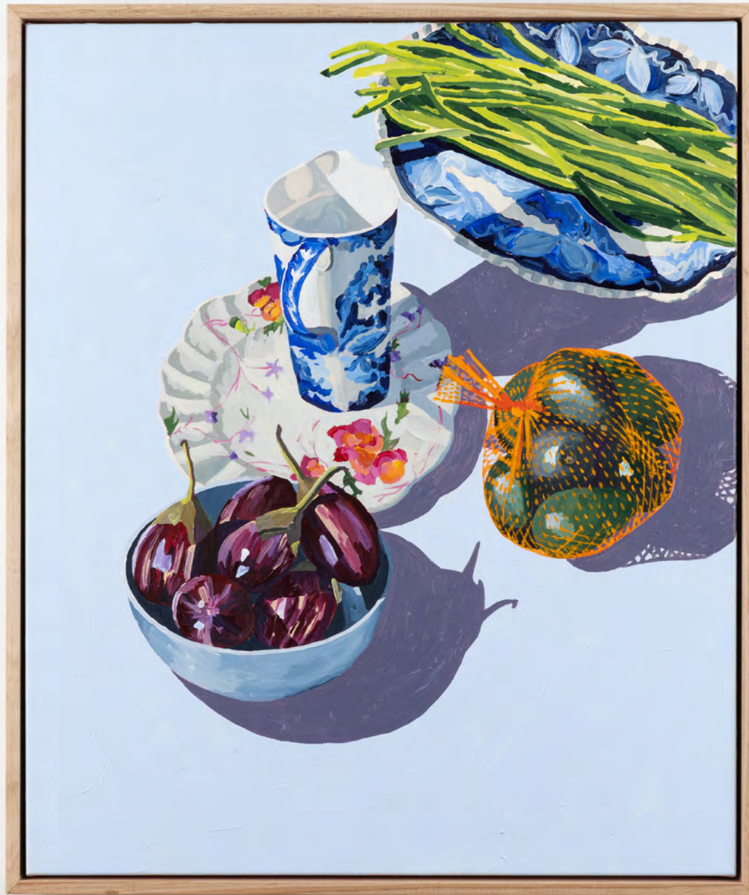
Bethany Saab Beans at the back 2022 acrylic on canvas 60 x 50 cm $1,700