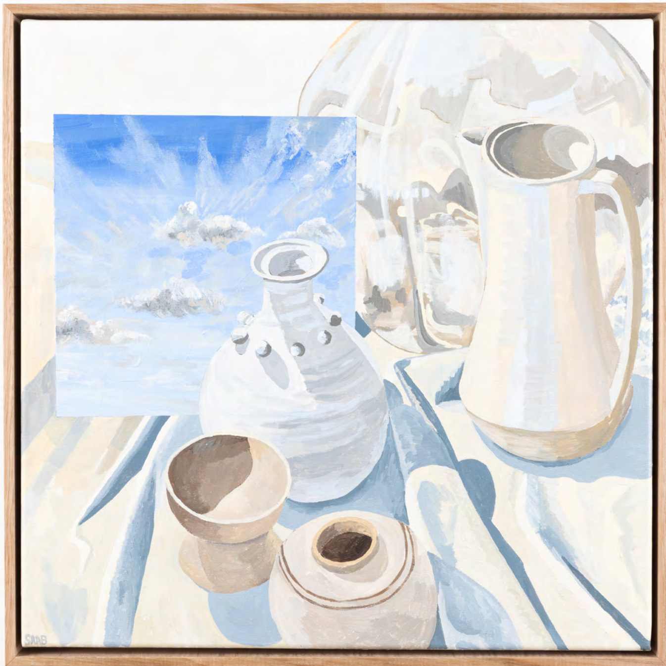
Bethany Saab Still life, blue sky 2022 acrylic on canvas 50 x 50 cm $1,450