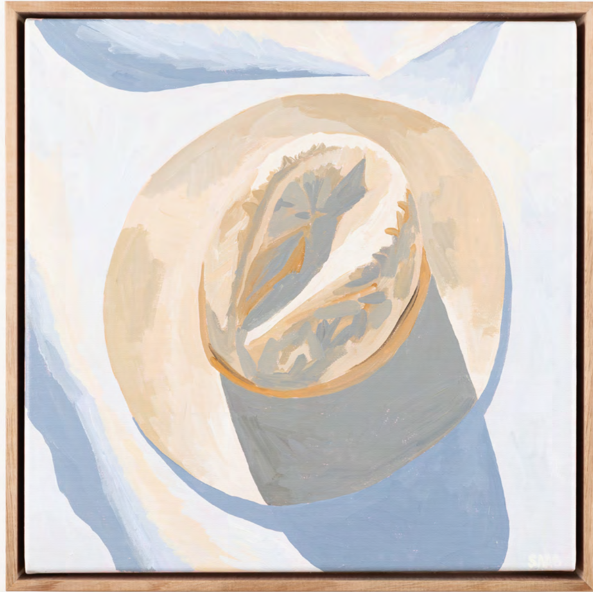
Bethany Saab Hat I 2022 acrylic on canvas 40 x 40 cm $1,200