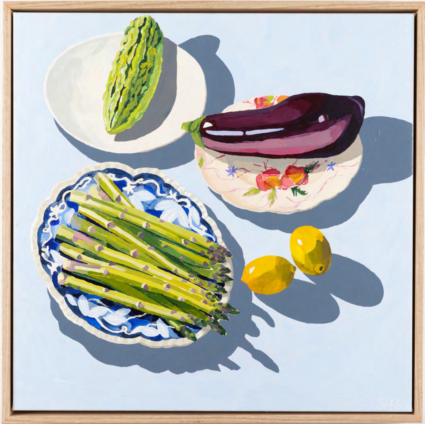
Bethany Saab Asparagus hit 2022 acrylic on canvas 50 x 50 cm $1,450