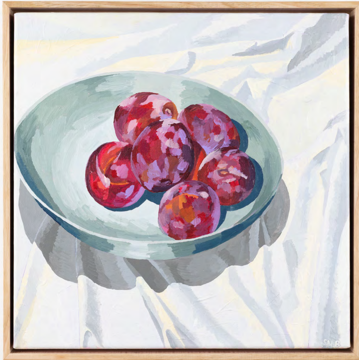
Bethany Saab Plums I 2022 acrylic on canvas 40 x 40 cm $1,200