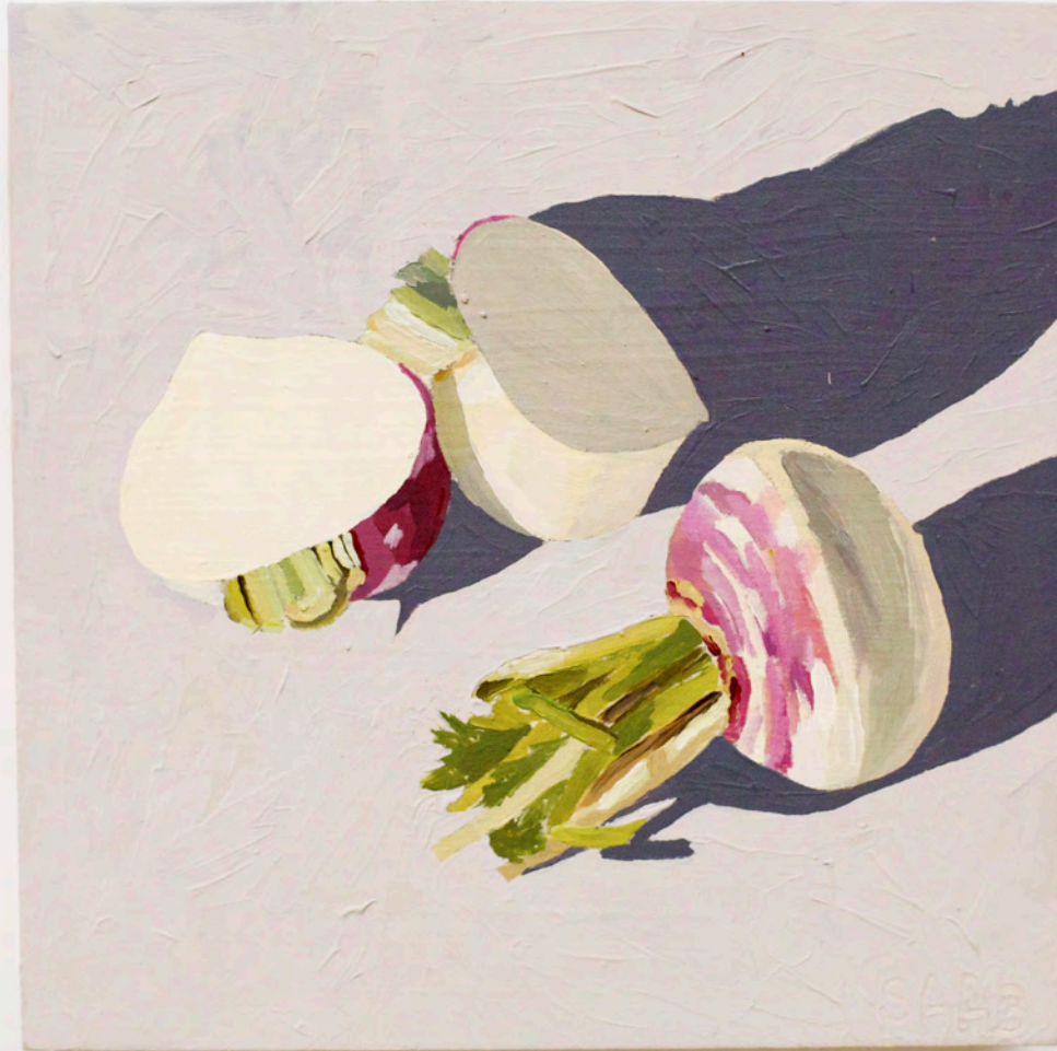
Bethany Saab Turnips I 2022 acrylic on cradled board (unframed) 20.5 x 20.5 cm $490