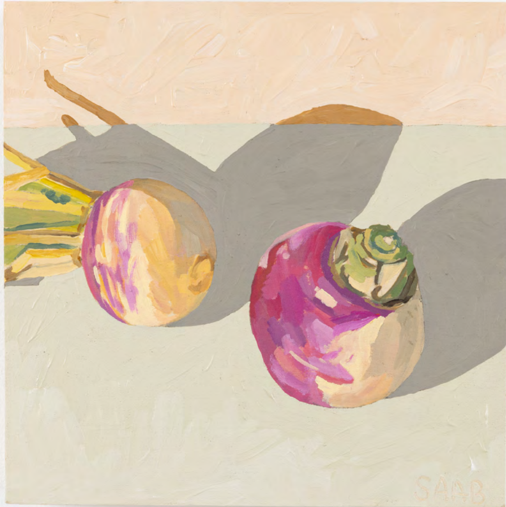
Bethany Saab Turnips III 2022 acrylic on cradled board (unframed) 20.5 x 20.5 cm $490