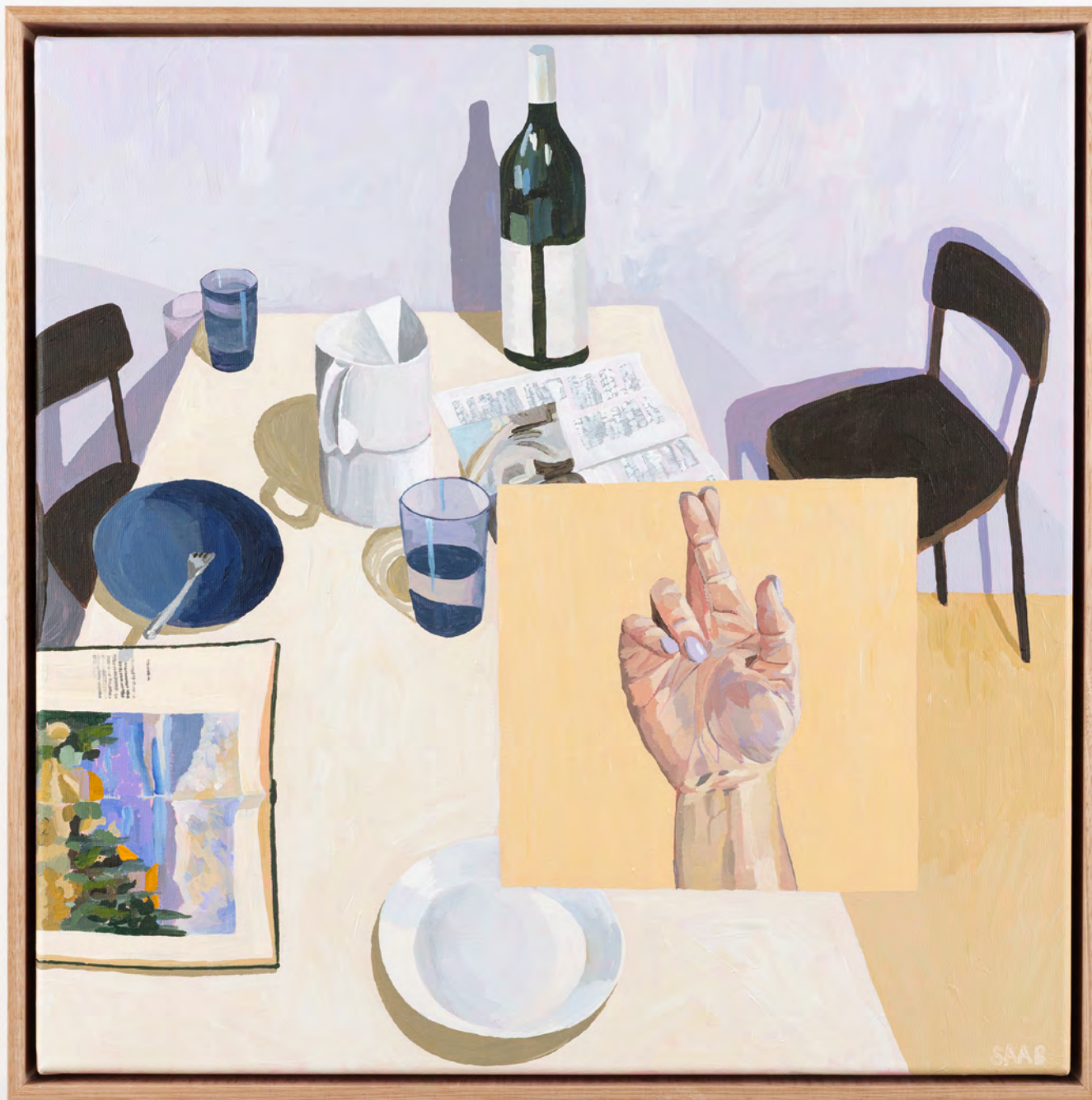
Bethany Saab Hoping 2022 acrylic on canvas 50 x 50 cm $1,450