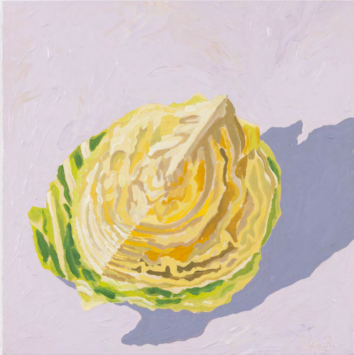
Bethany Saab Savoy 2022 acrylic on cradled board (unframed) 20.5 x 20.5 cm $490