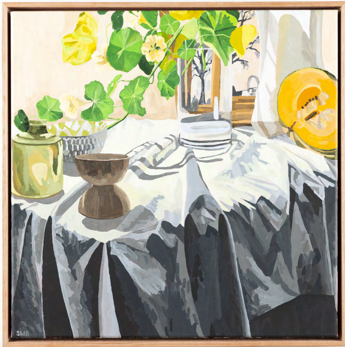
Bethany Saab Nasturtiums, Night 2022 acrylic on canvas 50 x 50 cm $1,450