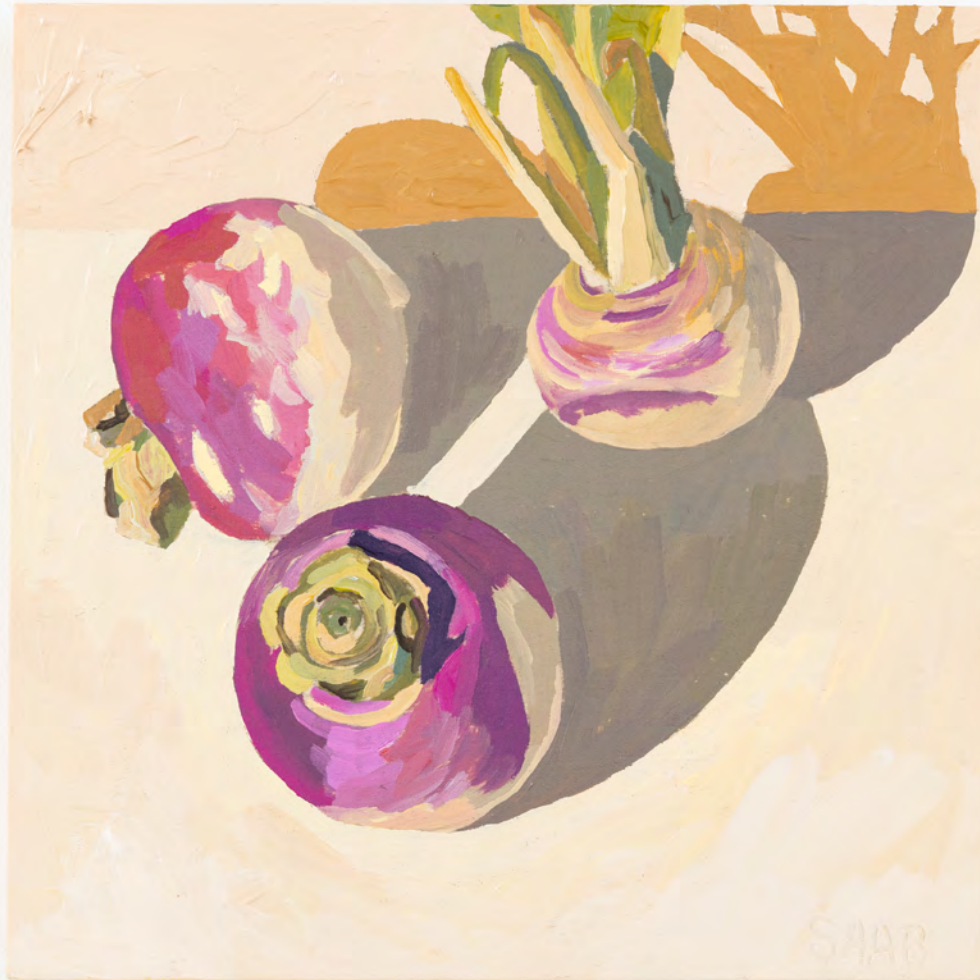
Bethany Saab Turnips II 2022 acrylic on cradled board (unframed) 20.5 x 20.5 cm $490