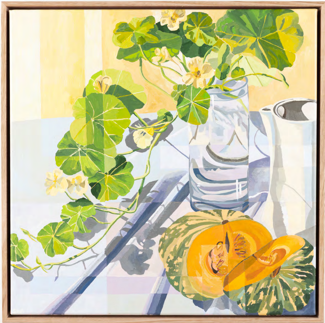
Bethany Saab Nasturtiums, Day 2022 acrylic on canvas 50 x 50 cm $1,450