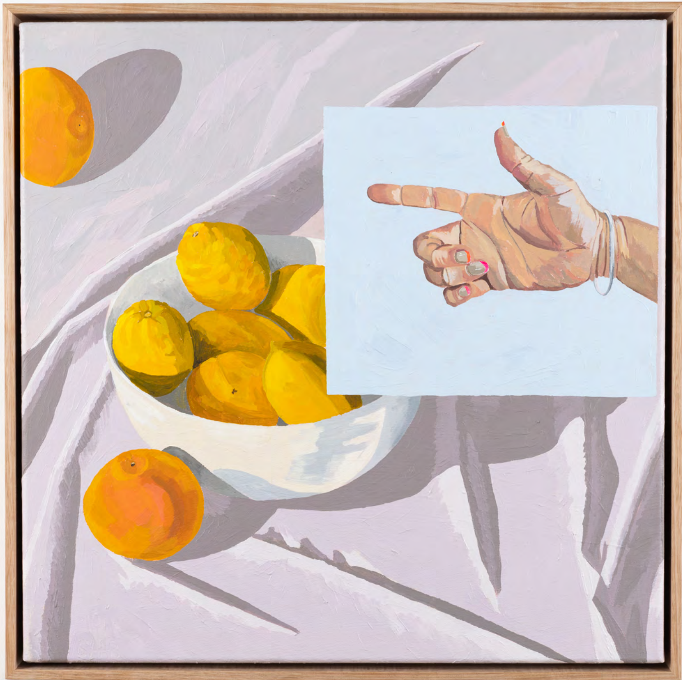
Bethany Saab Gesture I (pointing) 2022 acrylic on canvas 50 x 50 cm $1,450