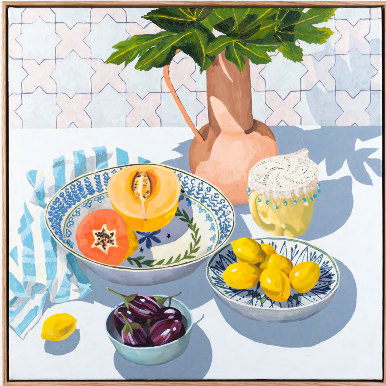
Bethany Saab Cut fruit, somewhere warm 2022 acrylic on canvas 76 x76 cm $2,200