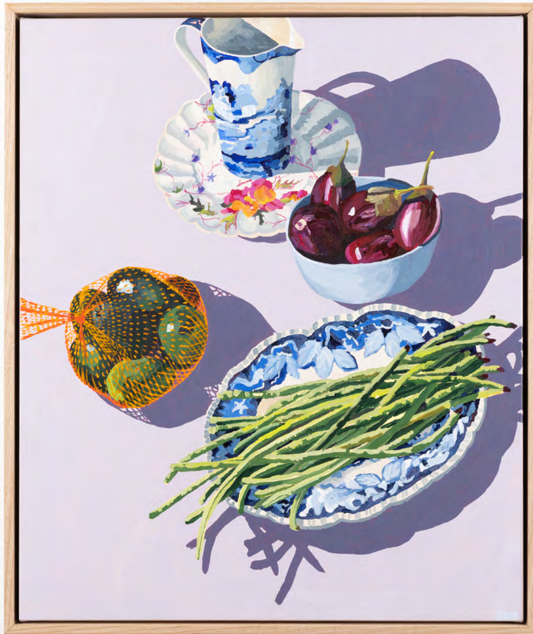
Bethany Saab Beans at the front 2022 acrylic on canvas 60 x 50 cm $1,700